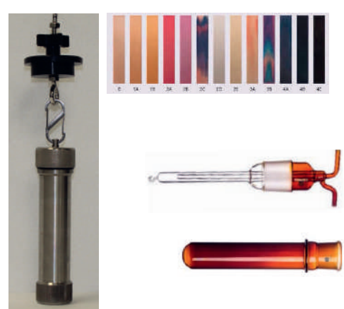
Corossion Accessory Kit available